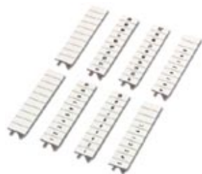
Zack marker strip, 10-section, horizontally labeled with the consecutive numbers: 21 ... 30, white, width: 5 mm

Please be informed that the data shown in this PDF Document is generated from our Online Catalog. Please find the complete data in the user's documentation. Our General Terms of Use for Downloads are valid ( http://phoenixcontact.com/download )